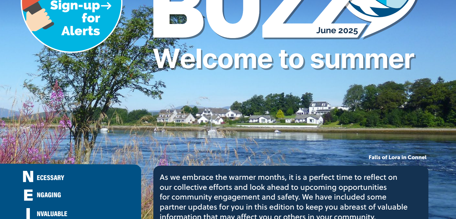
Falls of Lora in Connel

N ECESSARY E NGAGING I NVALUABLE G ETTING TO KNOW YOUR NEIGHBOURS H ELPFUL B ESPOKE TO LOCAL NEEDS O N THE RISE! U NITY R ESILIENT COMMUNITIES L OOKING OUT FOR EACH OTHER I NCLUSIVE N OT TO BE UNDER ESTIMATED E NHANCING WELLBEING AND ENCOURAGING COMMUNITY SPIRIT S USTAINABLE S UPPORTIVE